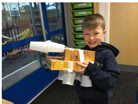
Space ships, aliens and robots in year one