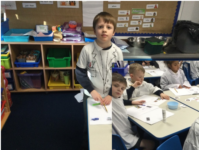
Year two scientists - recording their investigations and observations.