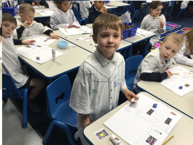
Have aliens travelled to BHI during the Christmas holidays? Possibly.